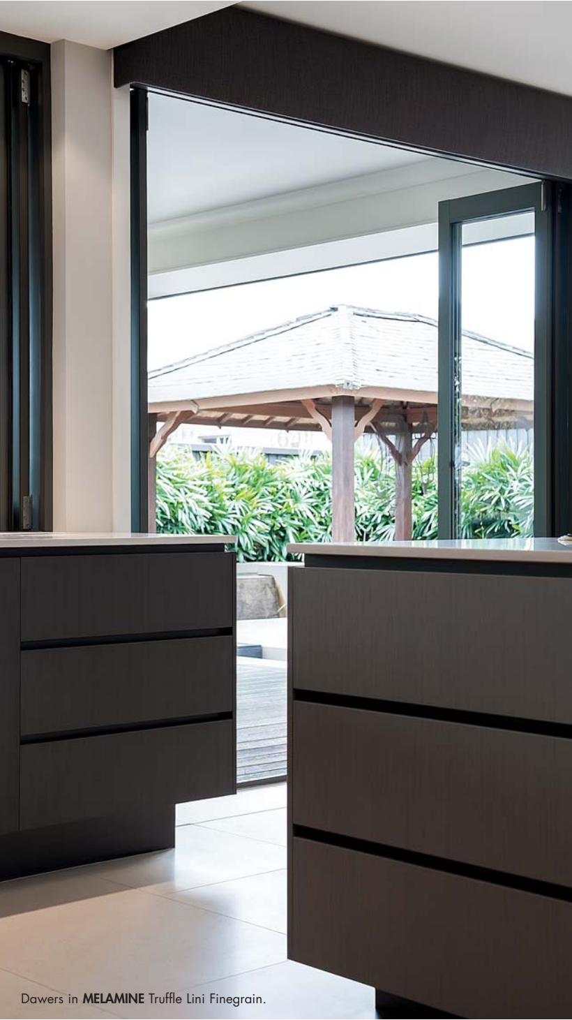
Dawers in MELAMINE Truffle Lini Finegrain.